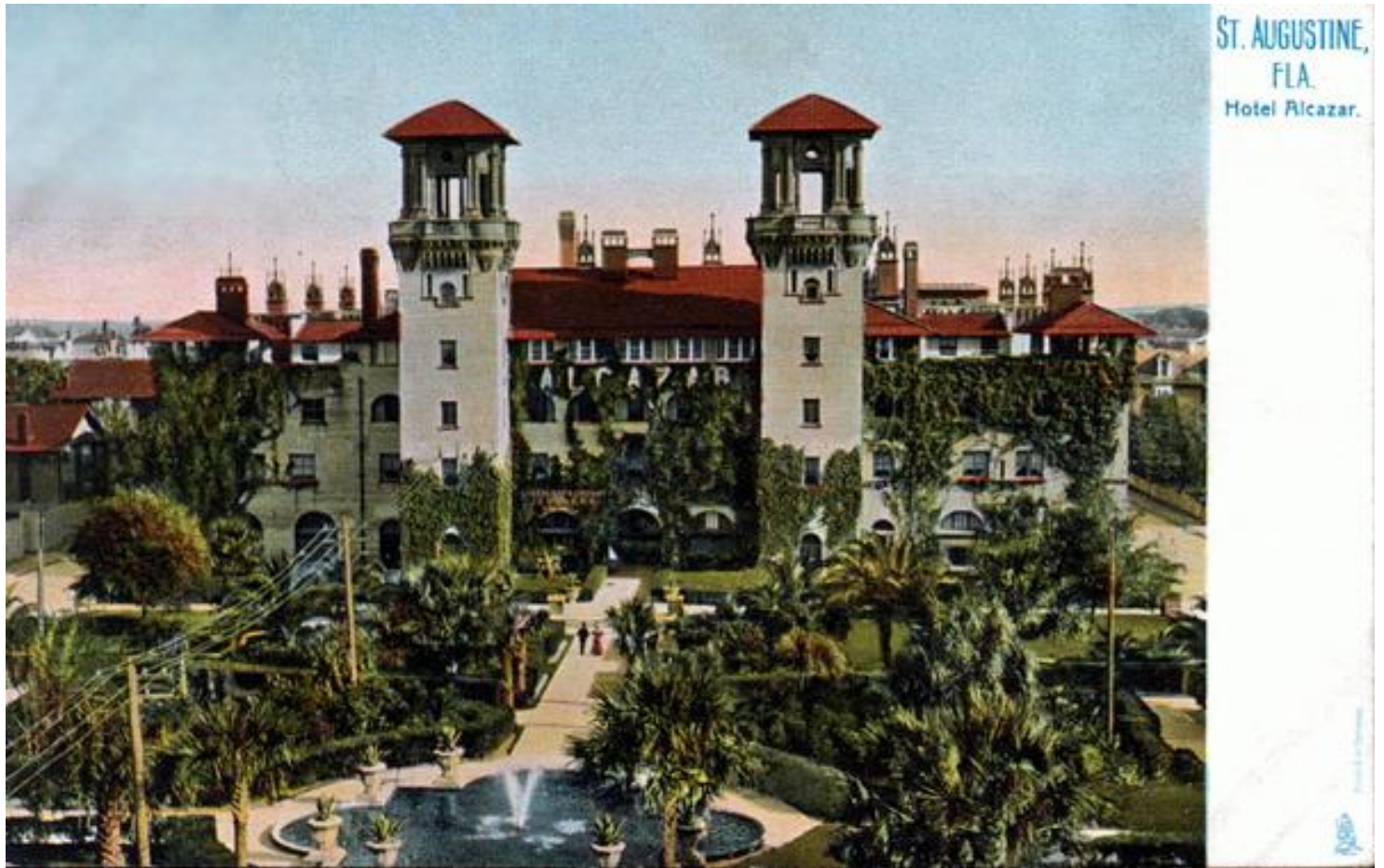
Alcazar Hotel - Saint Augustine, Florida (1900 ca.).