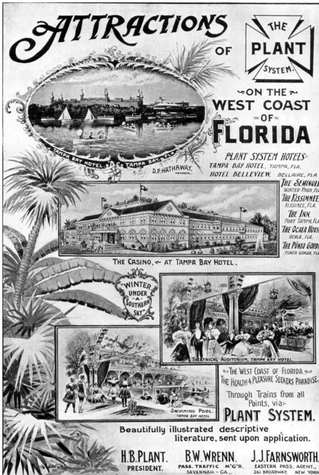
Advertisement of the Plant System including the Tampa Bay Hotel - Tampa, Florida (1896-12-19).